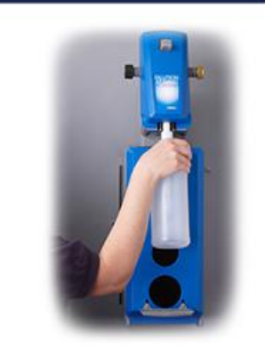
Remote point and fill activation is an available option on any unit